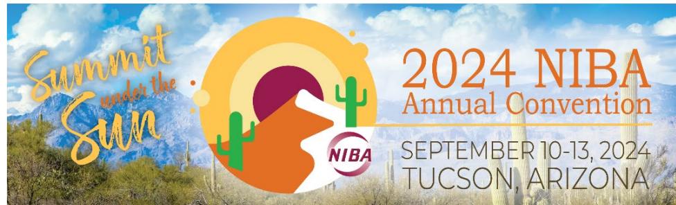
Exhibit Booth Assignments